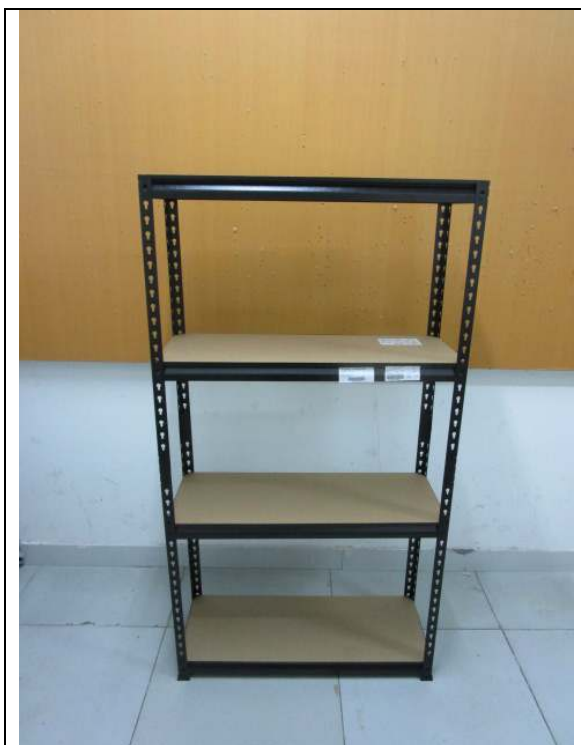
Before loading -- Image 1