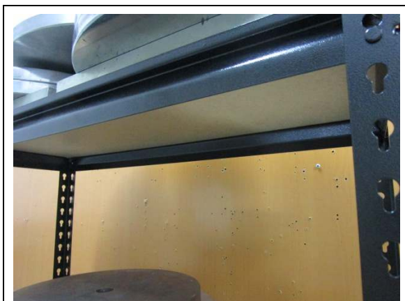
Loaded after 48 hours -- Image 3