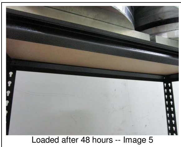
Loaded after 48 hours -- Image 5