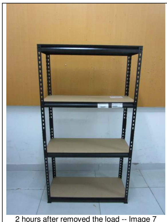
2 hours after removed the load -- Image 7