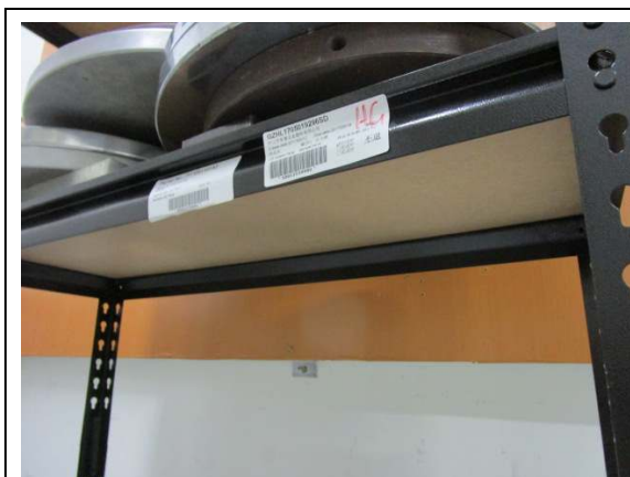
Loaded after 48 hours -- Image 4