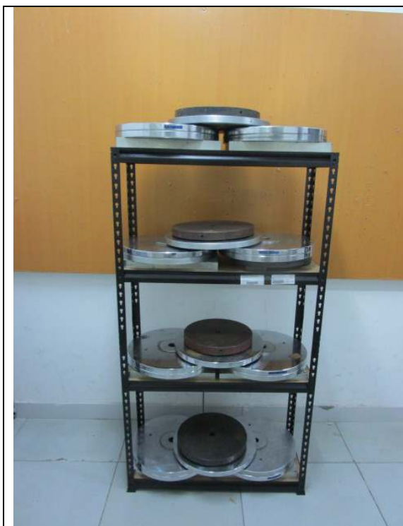
Loaded after 48 hours -- Image 2